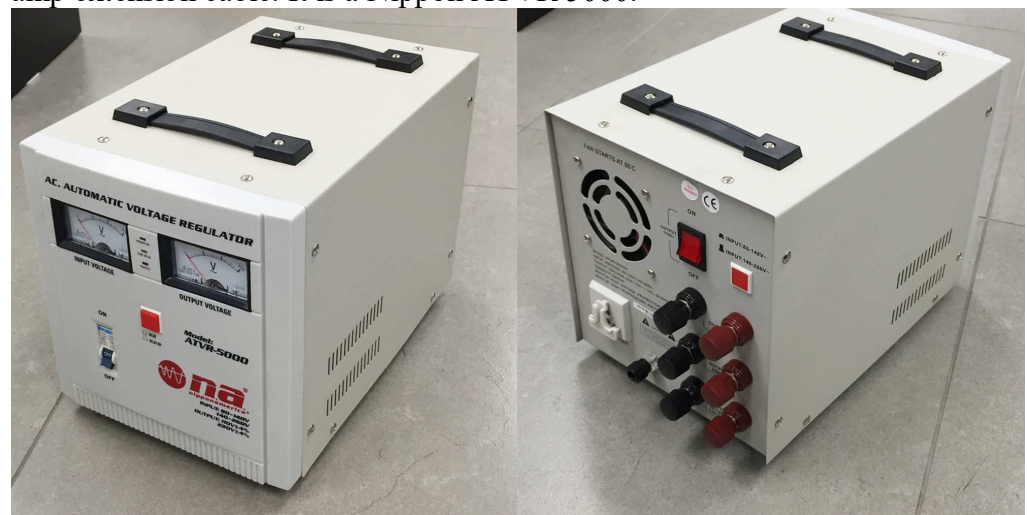
Go to E-Bay and search for Nippon America automatic voltage regulator ATV 5000

amp extension cable. It is a Nippon ATVR 5000.