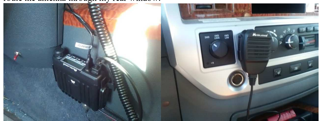
They plug into a cigarette lighter, you may need a splitter. Ensure you mount it where there is air flow around the unit.

We are now going to GRMS base units exclusively. We have found they are much better in range than CB's, plus much easier to install. The one we are moving to is the Midland micromobile MXT115 or MXT275 15 watt GRMS radio (about $150 including antenna). You can easily install this on a temporary basis and the antenna cable is thin enough not to be damaged by your rubber door seal if you cannot fish it through the firewall. It plugs into a cigarette lighter. You can manage with the 5 watt version, but the wagon master may not be able to hear you if you are not near the front. This radio is available direct from Midland or from Amazon and some other sources, simply google it. Some links are below. They are fully compatible with the handheld GMRS radios we also require you to have. The images below are my own unit, I used the Velcro they supplied and was able to route the antenna through my rear window.